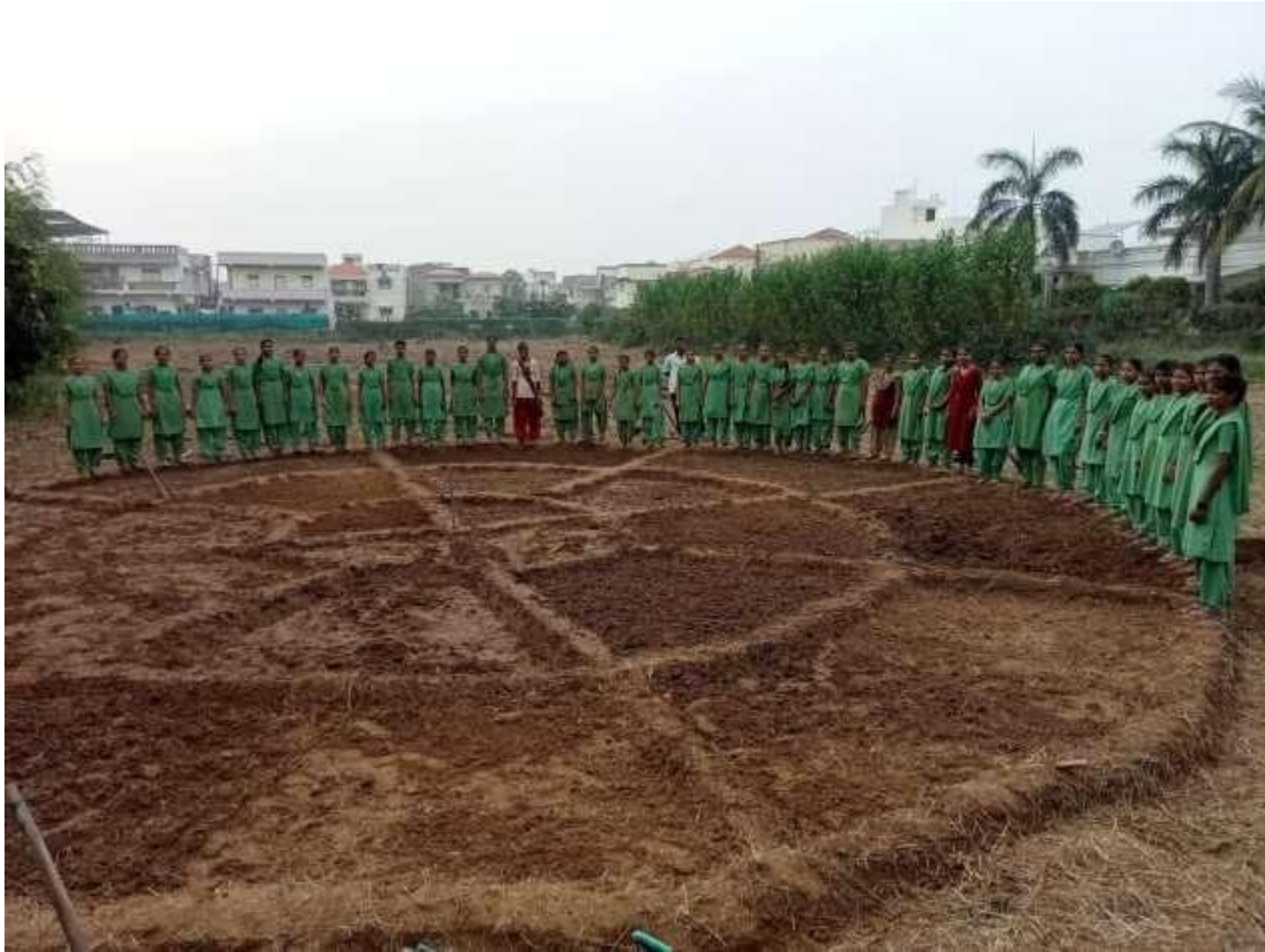
Circular organic nutritional garden was created by the LEAF students of Vidyadeep Community College.