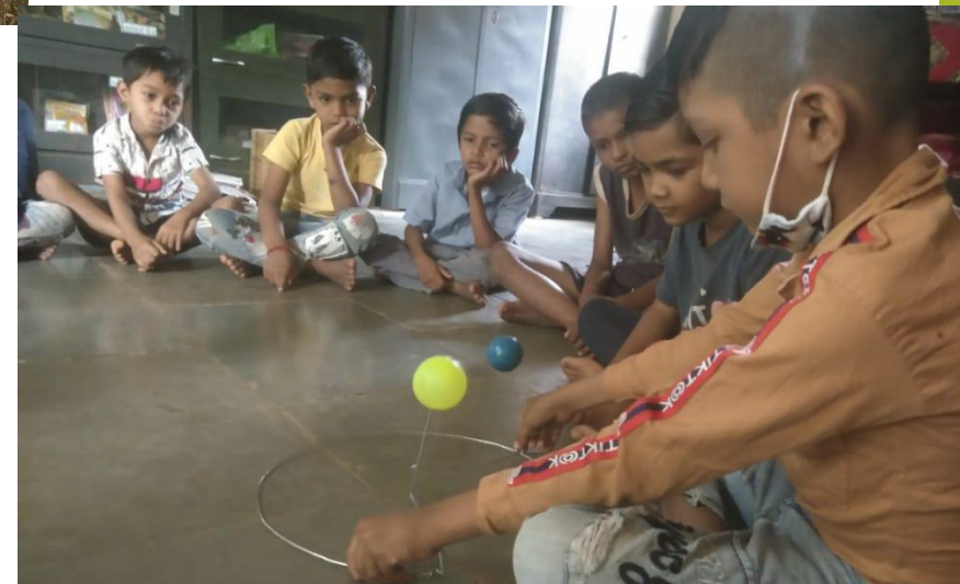
Innovative Teaching and Learning programs