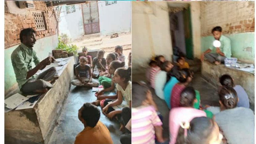
Students engaged in activities