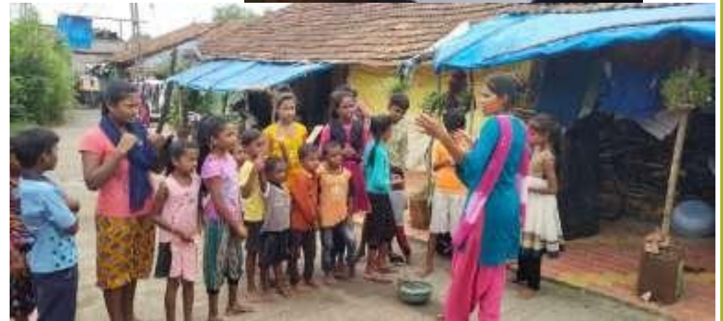
Photos of the workshop