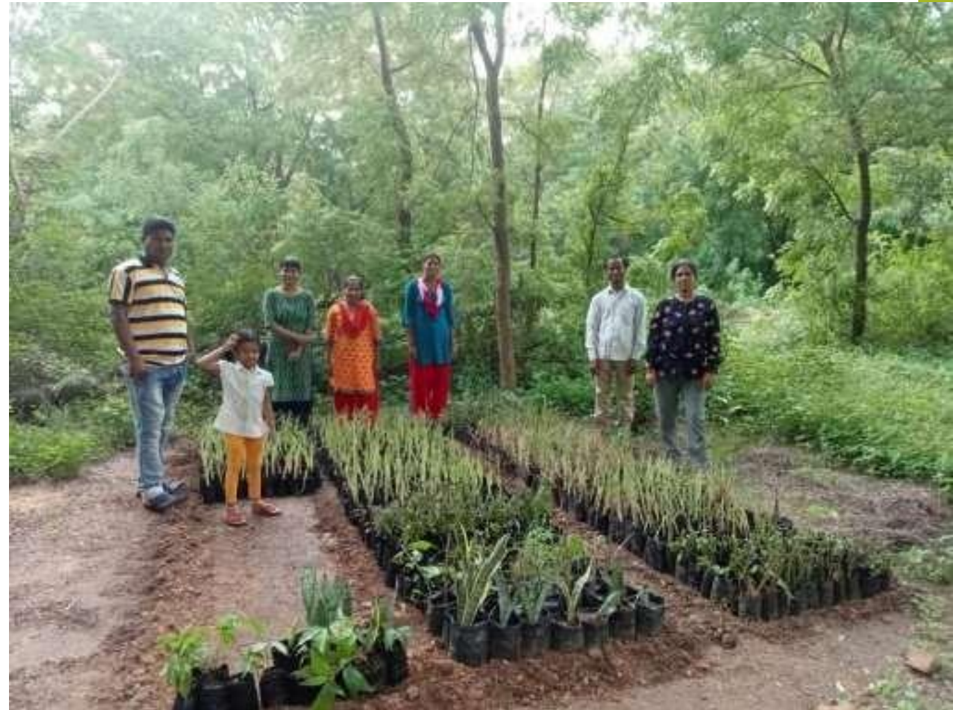
GBT's Eco-education team creating a herbal nursery at Martinwadi, XTI Campus, Sevasi