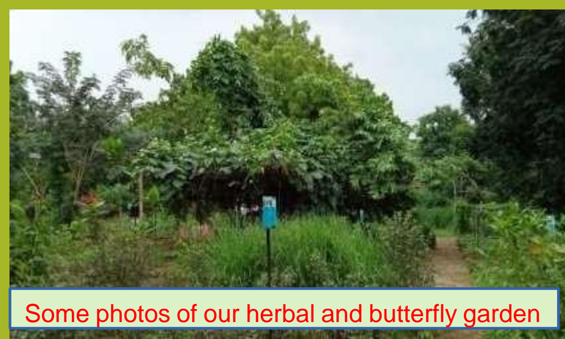
Some photos of our herbal and butterfly garden