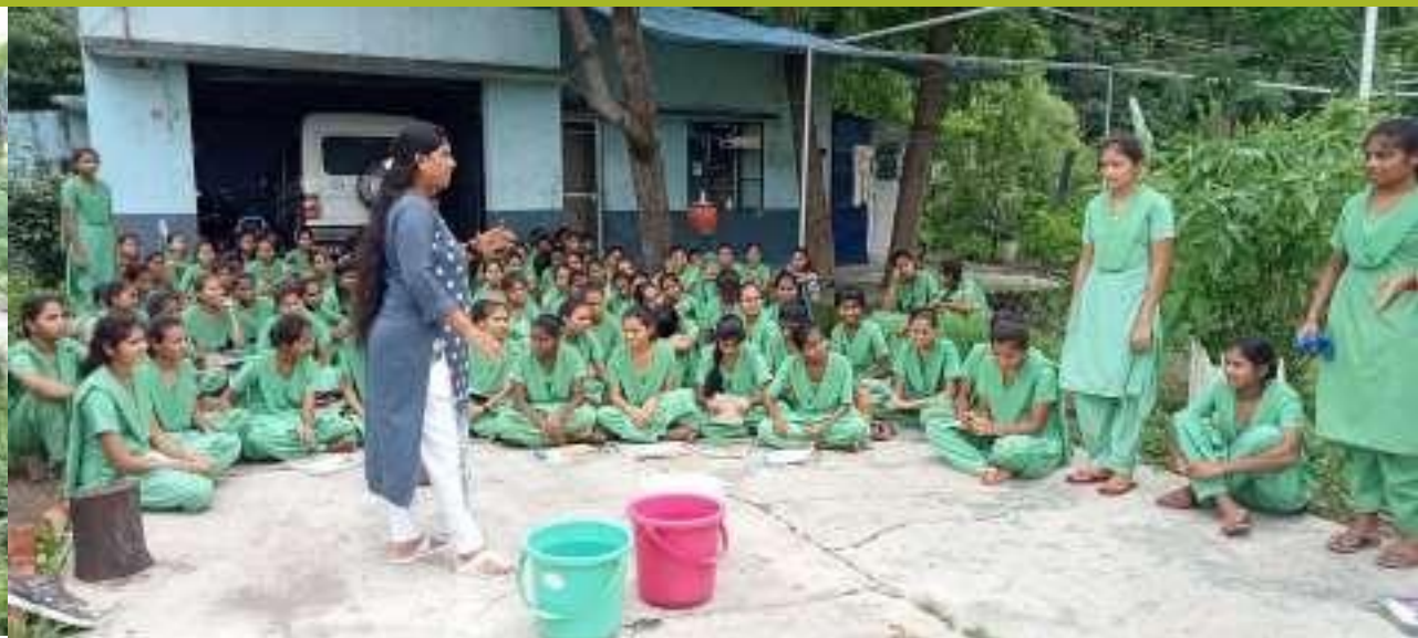
LEAF students learning through activities the importance of water conservation