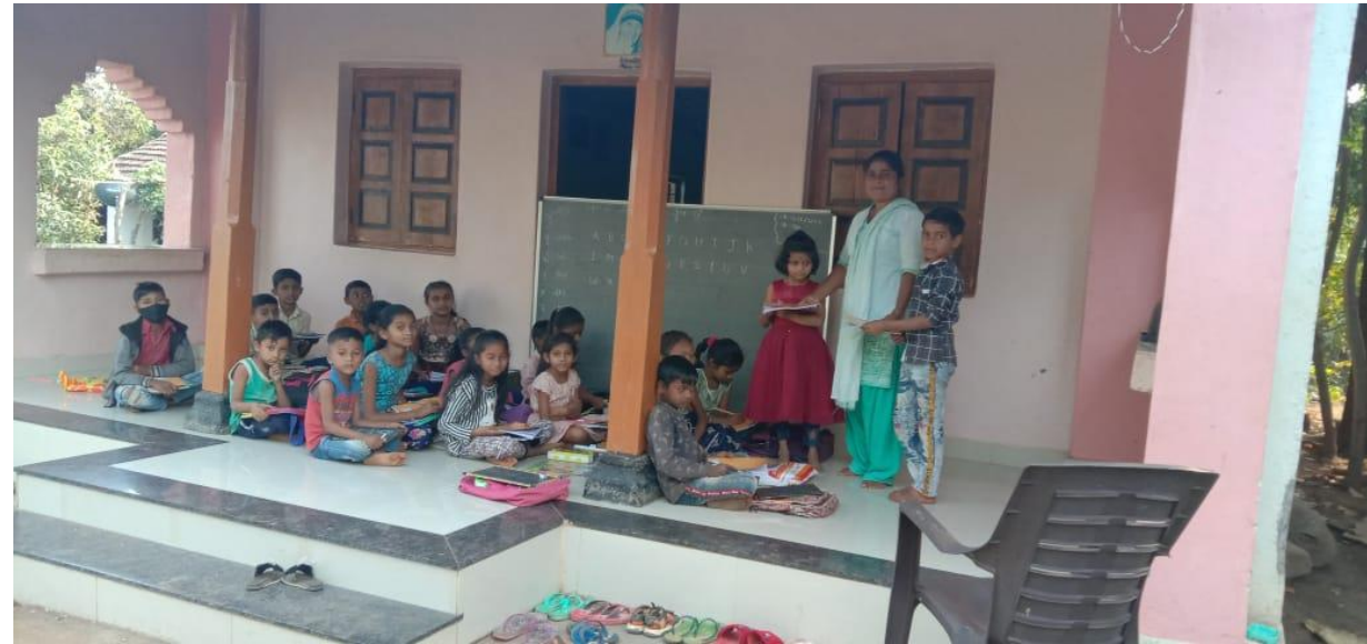
Community Learning centres