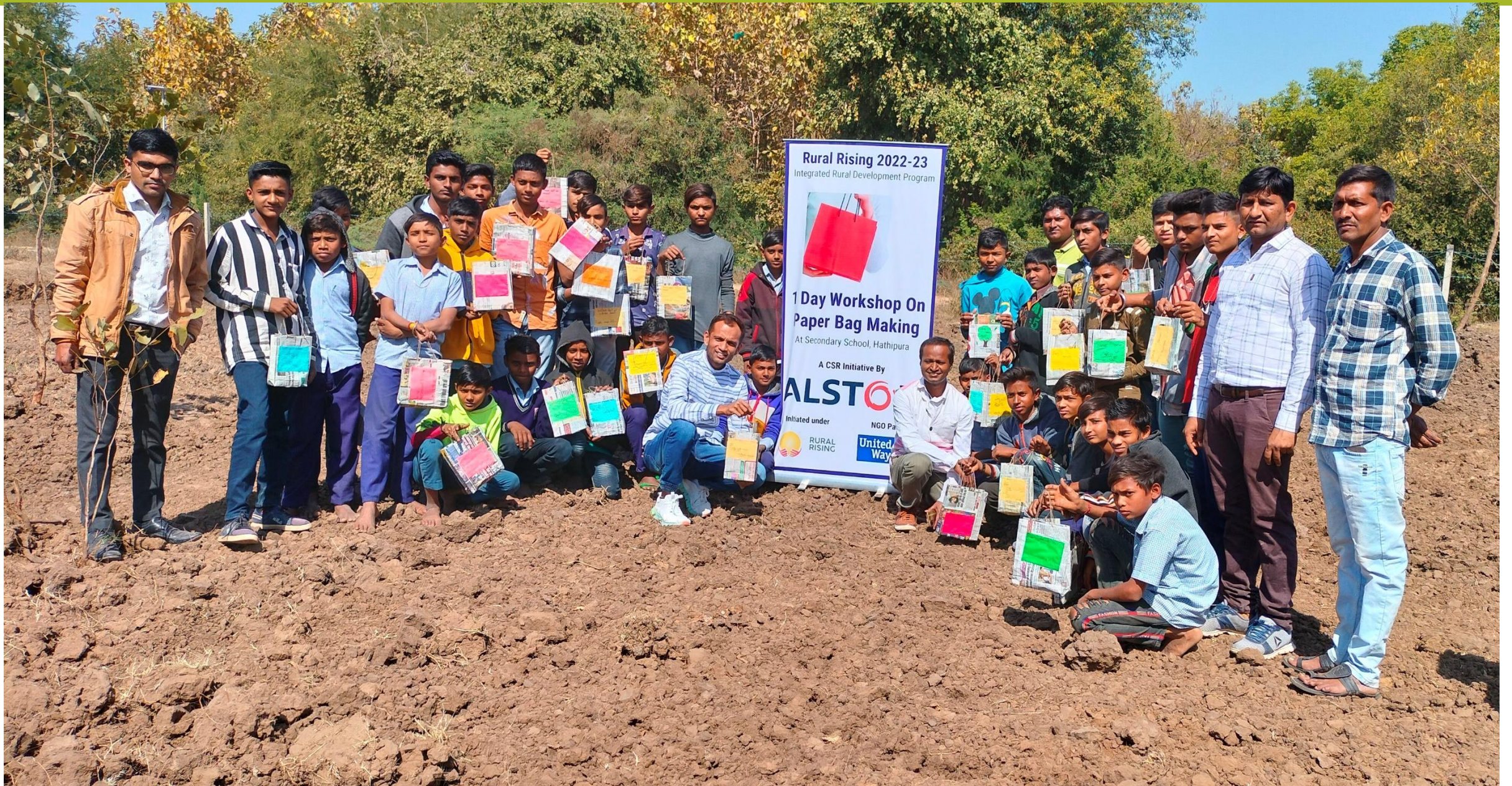
United way Baroda invited GBT Team to conduct papermaking workshops for the children in government school near Umeta.